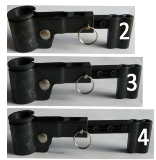
Fig. 4-A Fig. 4-B

- Following the Pin Setting shown (Fig. 4-A and 4-B), set telescoping rod to proper location and install setting pin