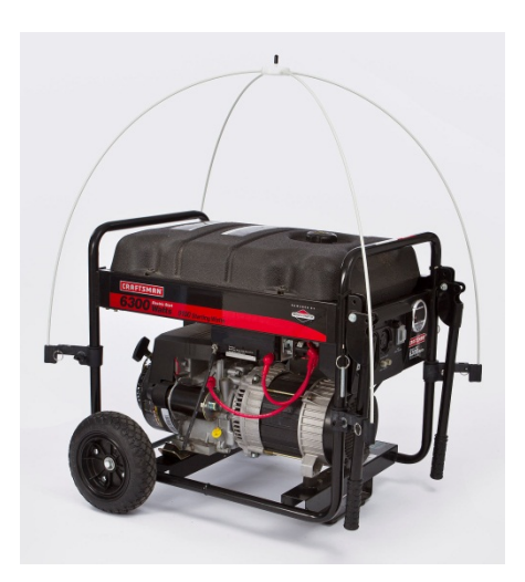
Fig. 5-A Fig. 5-B Fig. 5-C