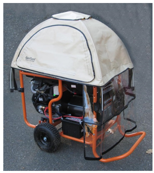
Fig. 6-A (GenTent 10k and GenTent 20k)